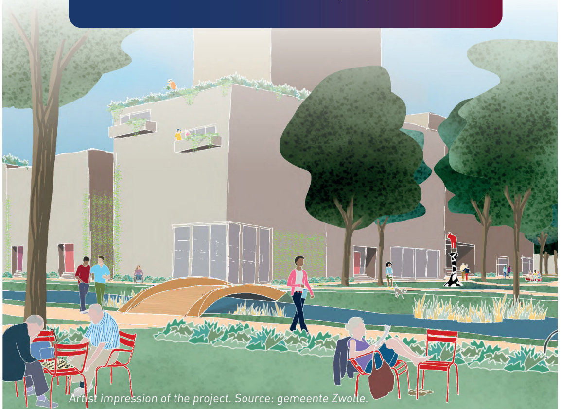
Artist impression of the project.

The Green Benefits Indicator allows urban planners to quantify the impact of predefined green and blue measures into financial and other benefits for residents and the municipality.