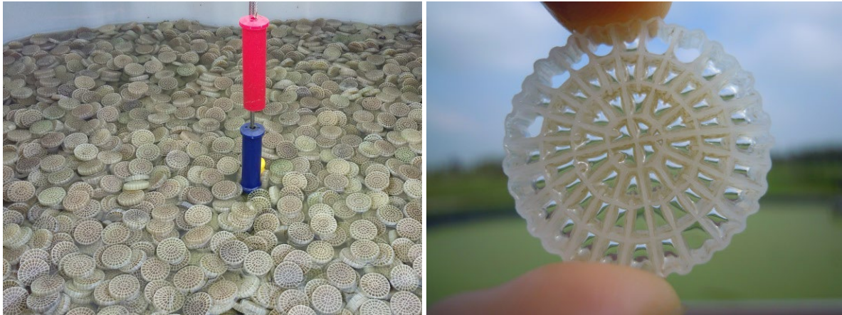
Photo 4: Moving Bed Biofilm Reactor at PCS, filled with AnoxKaldnes K5 carriers

Photo 4 shows a detail of the MBBR at PCS. The MBBR consists of a cubitainer filled with water and plastic carriers on which a biofilm develops. In this installation, AnoxKaldnes K5 carriers are used with a specific surface area of 800 m 2 /m 3 . The tank is 40% filled with these carriers. At regular intervals the carriers are aerated, in 2021 aeration was done every 3 hours, for 15 min each time. In 2022, this was adjusted to 1 min every hour. Based on the water level between 2 sensors (minimum and maximum level), the water volume in the MBBR is controlled. When the water level has reached the minimum level, water from the storage pond is pumped into the MBBR until the maximum level (about 80% of the total volume) is reached. For the MBBR at the PCS, this means that 100 l of water is then pumped from the disposal pond into the MBBR, this takes 3 min each time. The residence time of the water in the filter is 8 hours. The effluent is regulated to 2 l/min (2.88 m 3 /day).