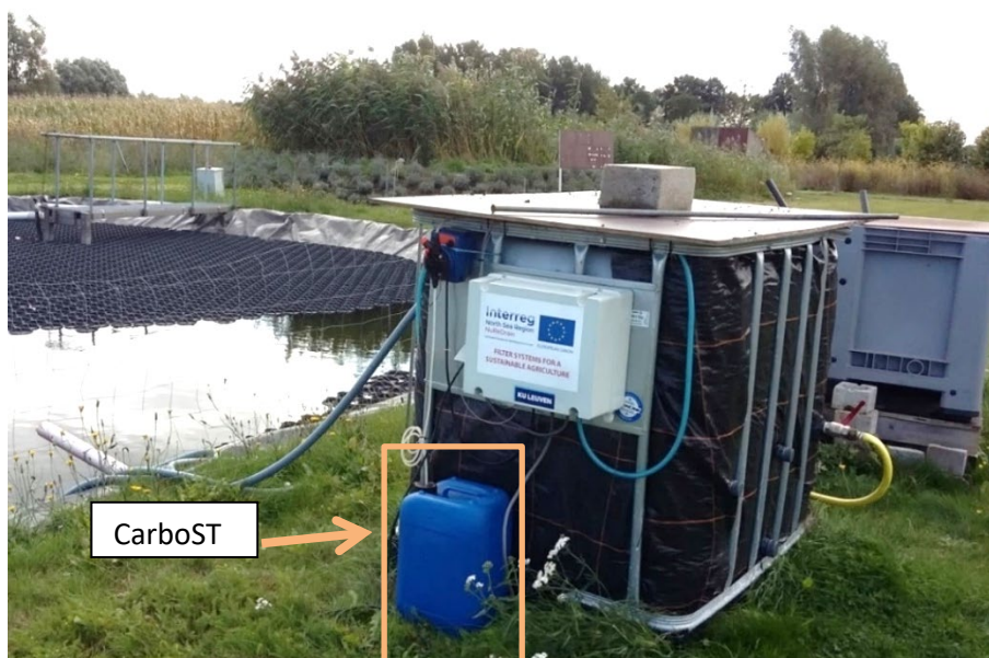
Photo 3: Moving Bed Biofilm Reactor at PCS with CarboST as C-source