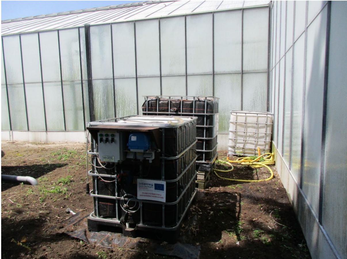
Photo 10: 2-in-1 N and P do-it-yourself filter system at Filip Willems